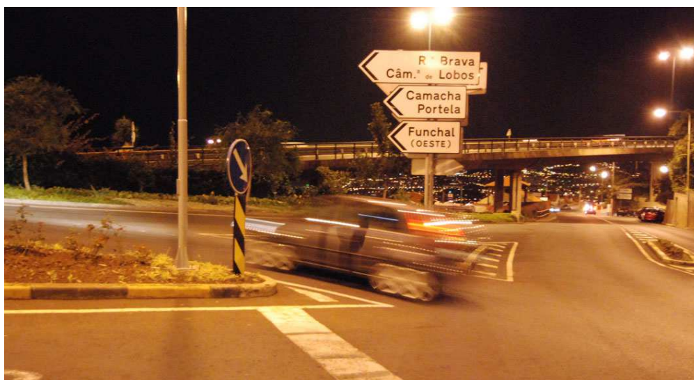
Picture #5: 600 m after Exit 13, immediately after passing under the bridge, "carefully watching traffic at this 4way crossing", turn left and drive up on the spiral ramp, into the Estrada da Boa Nova = ER 102.