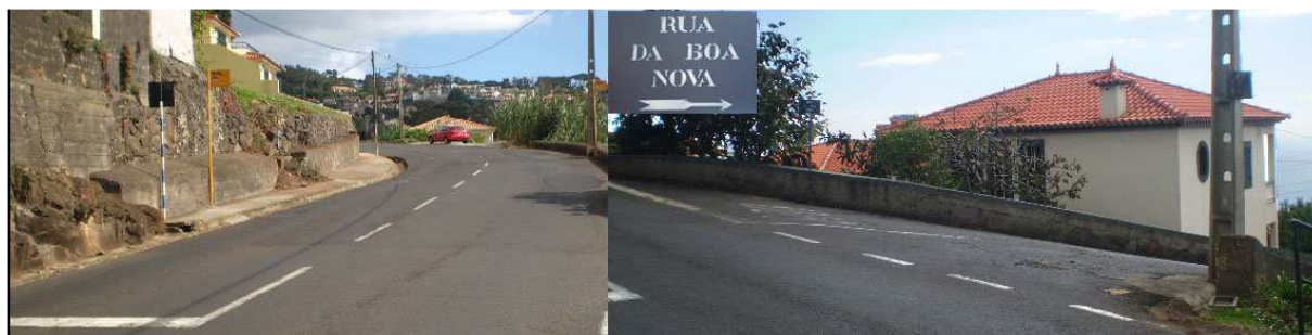
Picture #6. ER 102 at Rua da Boa Nova, Turn right downhill into Rua da Boa Nova.