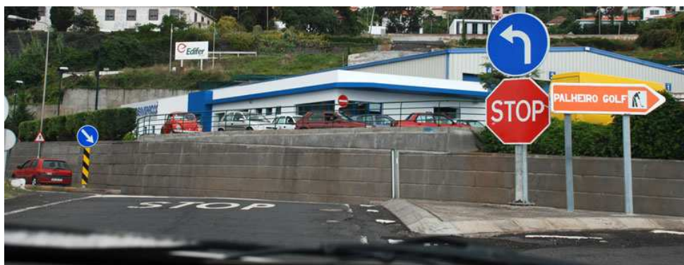
Picture #2: Turn left into ER 101 (old airport road) after leaving the Via Rápida at Exit 13.

You drive from the airport towards Funchal about 14 km on the highway "Via Rápida" (VR 1) to Exit 13. (If you want to shop before you go to Quinta da Fajã you can find an excellent Supermarket "Pingo Doce" in Cancela Park shopping centre (open 9.00-22.00) off Exit 15.