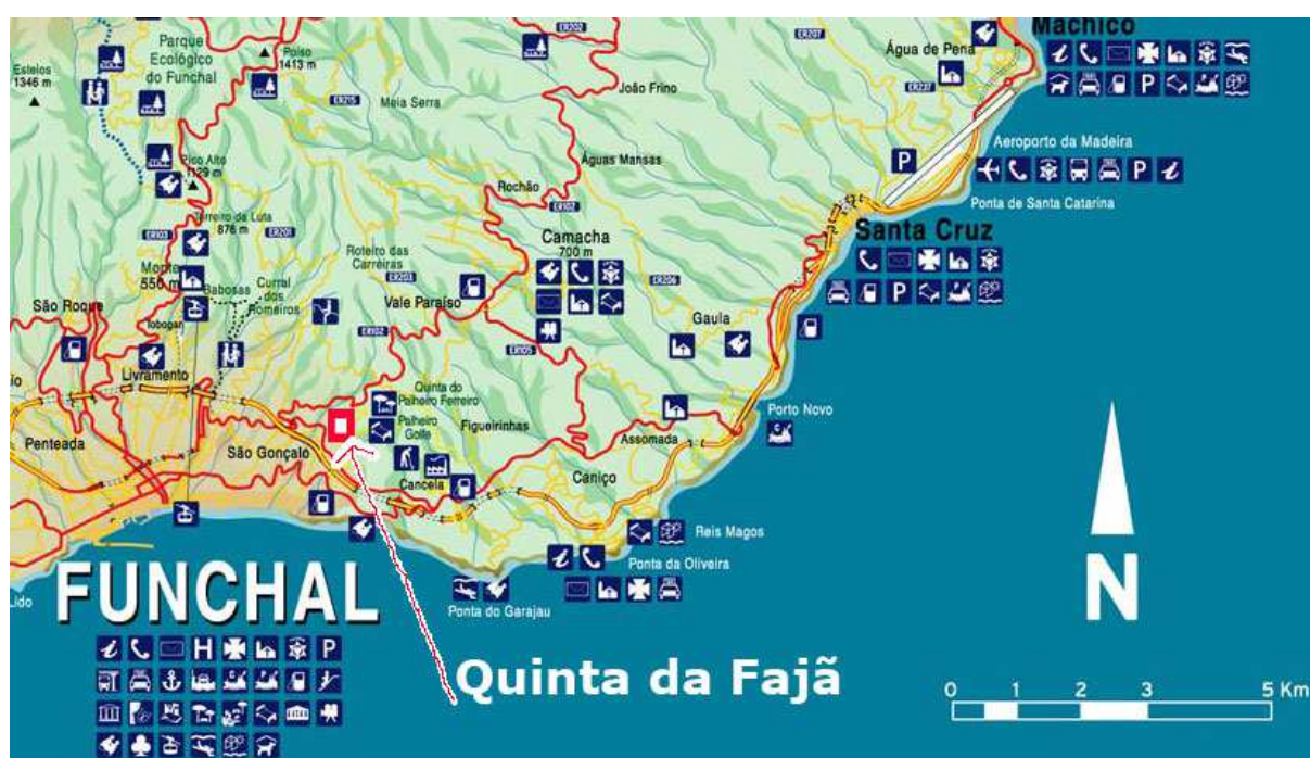
Map of southeast Madeira from the airport to Funchal centre

Quinta da Fajã is situated on the eastern hills of Funchal. It is approximately 15 minutes from the airport by car, and it is about the same time into the centre of Funchal.